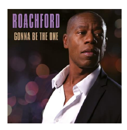
Listen to 'Gonna Be The One' <u>HERE</u> 'Twice In A Lifetime', released September 11, 2020 on BMG, is available to pre-order <u>HERE</u>

British singer, songwriter and musician Roachford releases 'Gonna Be The One' from his forthcoming album 'Twice In A Lifetime'.