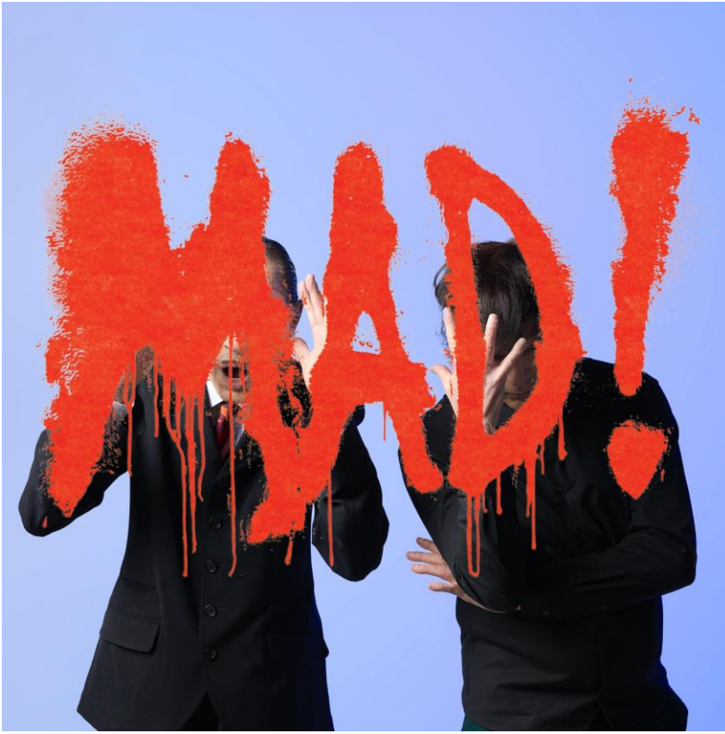
MAD! Album Artwork

Mon. Sept. 15 - Cleveland, OH @ TempleLive at Cleveland Masonic Wed. Sept. 17 - Toronto, On @ Queen Elizabeth Theatre Date tba – Chicago, IL @ Riot Fest Sat. Sept. 20 - St. Paul, MN @ Fitzgerald Theater Tue. Sept. 23 - Vancouver, BC @ Vogue Theatre Wed. Sept. 24 - Seattle, WA @ Moore Theatre Fri. Sept. 26 - Portland, OR @ Revolution Hall Sat. Sept. 27 - San Francisco, CA @ Golden Gate Theatre Mon. Sept. 29 - El Cajon, CA @ The Magnolia Tue. Sept. 30 - Los Angeles, CA @ The Greek Theatre